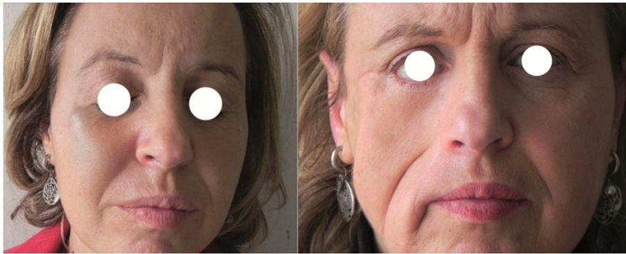
Figure 3 Pre-treatment clinical image and post-operative image with a good functional and aesthetic result.

addition, ECT of the lymphatic network surrounding the single metastatic nodule can improve local tumor control as demonstrated in patients with long-lasting response [23].