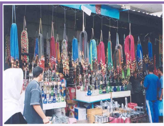
Figure 1 Water-Pipe store in an Arab village in northern Israel.