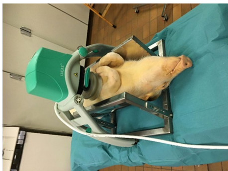
Fig. 1 Photo of the homemade pig holder showing the animal slightly turned to the right side to avoid injuries from the Lucas1 Cardiac Compression Device

The Utstein recommendations for animal experiments of resuscitation define circulatory arrest as a systolic BP below 25 mmHg [16]. However, since our primary outcome was carotid blood flow during 60 min of mechanical CPR, data were included even if BP decreased below 25 mmHg. The experiment was terminated if an animal had ROSC.